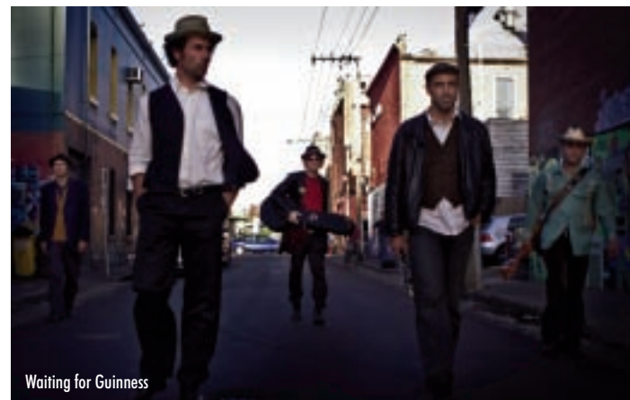
Waiting for Guinness